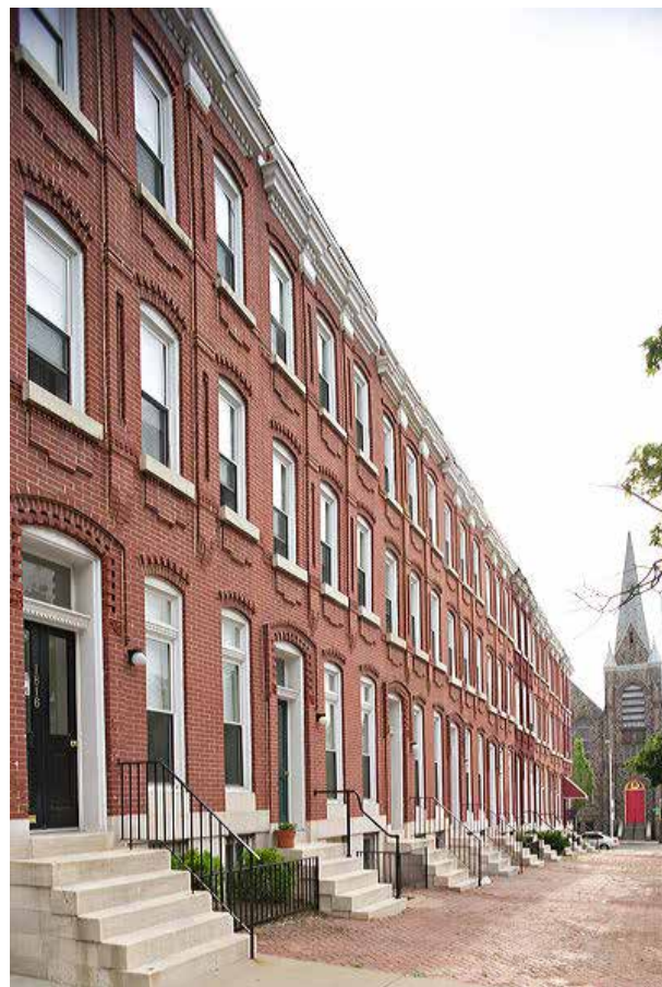
Bon Secours row homes

By 1997, Operation ReachOut evolved into Operation ReachOut Southwest, a nonprofit CDC comprised of community businesses, churches, residents, partner organizations, and neighborhood associations. Bon Sec-