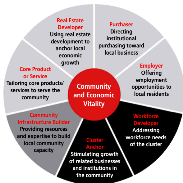
FIGURE 1: ICIC’S ANCHOR INSTITUTION STRATEGIC FRAMEWORK

■ Direct: Anchor’s own business activities ■ Leader: Lead a joint effort with other organizations ■ Collaborator: Use resources and influence in collaboration with a broad range of stakeholders to identify and serve anchor and community needs