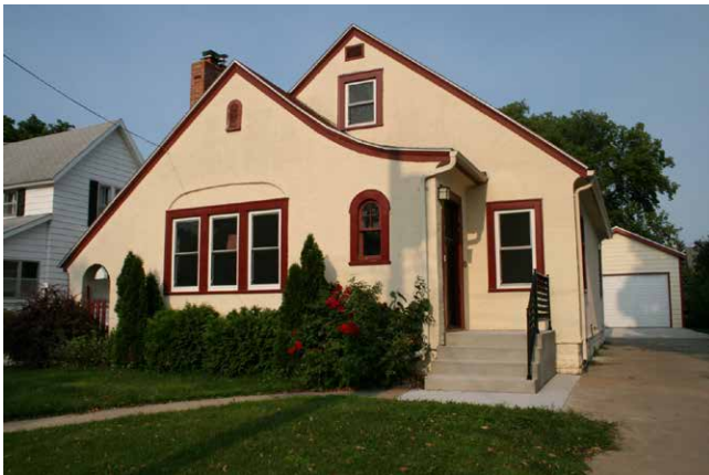
First Homes home exterior